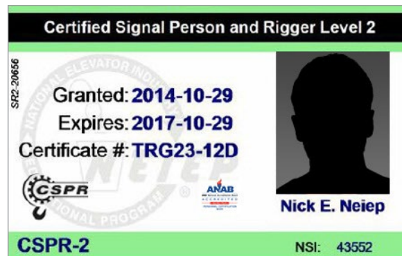
CSPR-2 Certification Card Front