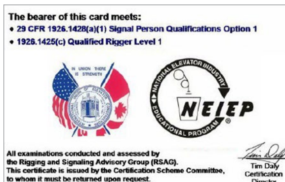
CSPR-1 Certification Card Back