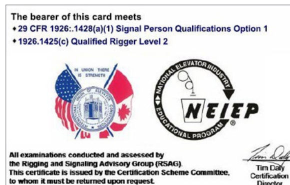
CSPR-2 Certification Card Back