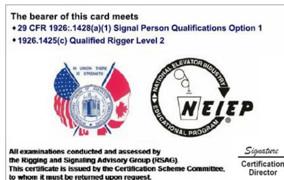
CSPR-2 Certification Card Back