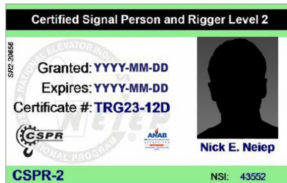
CSPR-2 Certification Card Front